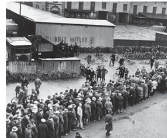
The unemployed queue outside the Job Centre in Hannover, spring 1932. The words on the fence read 'vote Hitler.'