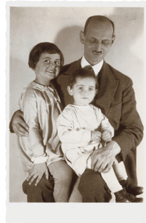
Margot, Anne and their father, August 1931.