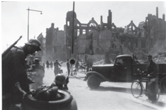
German soldiers enter the destroyed city centre of Rotterdam, May 1940.