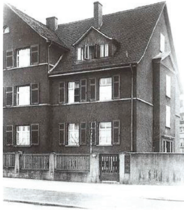
The house where Anne Frank was born - Marbachweg 307 in Frankfurt am Main (Germany).

The Frank and Holländer families have lived in Germany for generations. The Franks' are a liberal Jewish family. They feel connected to the Jewish faith, but are not strictly religious. In 1930, about 1% of the German population – around 500,000 people – are Jewish.