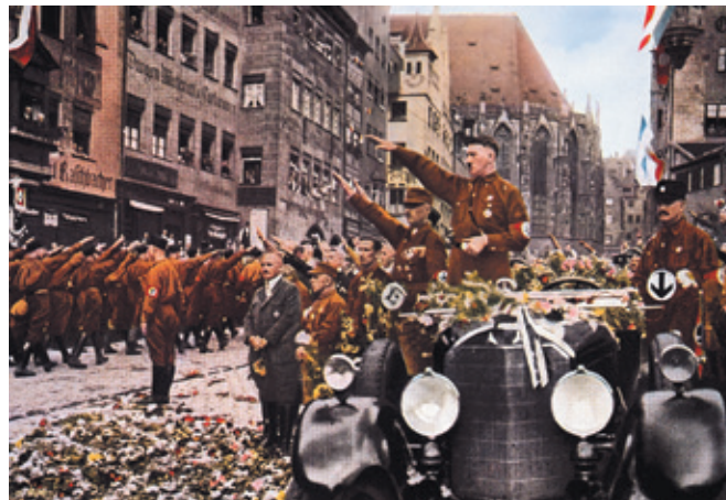
Adolf Hitler at the annual party rally in Nuremberg, 1927.

In 1924, after a failed coup, Adolf Hitler is imprisoned. Whilst there, he begins to write down his thoughts and ideas. The resulting book is 'Mein Kampf' (My Struggle). The book is published and circulated widely.