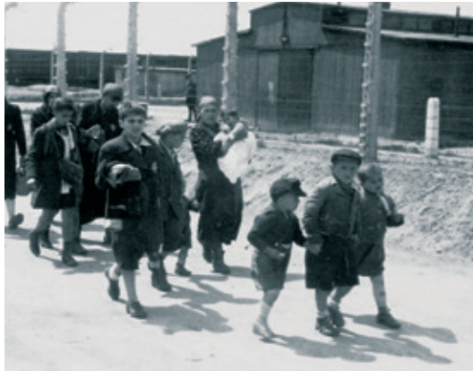
Jewish mothers and children on their way to the gas chambers in Auschwitz-Birkenau, May 1944.