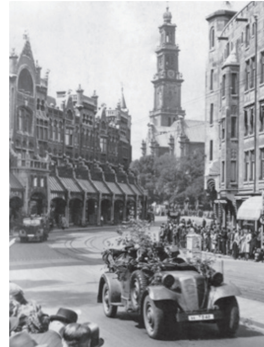
The German army enters Amsterdam near Otto Frank's company, 16 May 1940, Otto and Edith hope that the Netherlands will not enter the war. However, on 10th May 1940, the German army invades the Netherlands. Belgium and France are also occupied.

In contrast to the Polish people, the Nazis regard the non-Jewish populations of these Western-European countries as 'kindred peoples', therefore they do not commit the atrocities inflicted on the Poles.