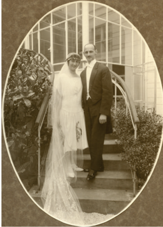
The wedding of Otto Frank and Edith Holländer, 12th May 1925.

The Frank and Holländer families have lived in Germany for generations. The Franks' are a liberal Jewish family. They feel connected to the Jewish faith, but are not strictly religious. In 1930, about 1% of the German population – around 500,000 people – are Jewish.