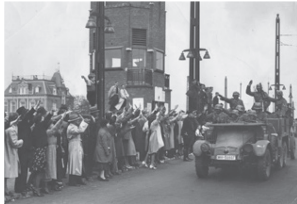
On 15 May 1940, the German Wehrmacht enters Amsterdam.