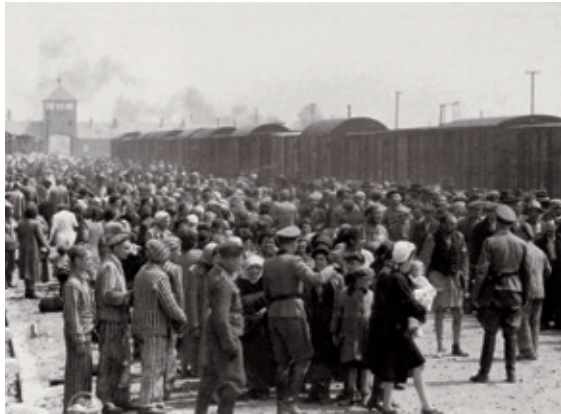
Jewish prisoners from Hungary on the platform at Auschwitz-Birkenau, May 1944.