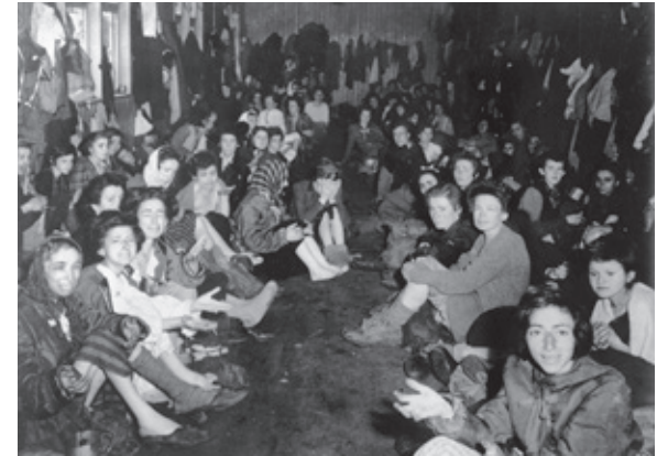
Starvation, cold and disease claim many lives in the overcrowded Bergen-Belsen concentration camp.